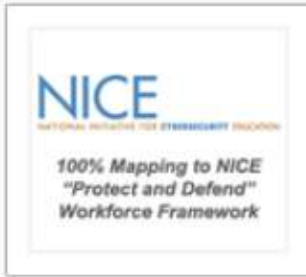
The National Initiative for Cybersecurity Education (NICE)