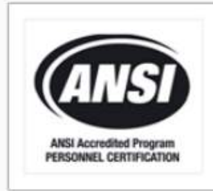
American National Standards Institute (ANSI)