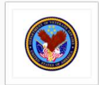
Department of Veterans Affairs